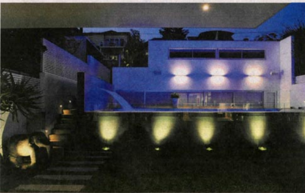
Room to play ... the new owners added a pool to the north-facing back garden.

A Victorian facade gives little hint of the ultra-modern extension behind.