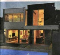
Two-faced ... the new wing.

bedrooms," Glover says. "The skylight also brings light into the children's playroom below. It's the other reason we installed a glass wall in the stairwell."