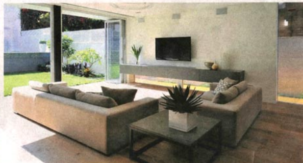
Sans frontières ... (left) bifold doors allow a seamless transition to the outdoor spaces; (above) the living and dining areas are completely open to the garden.