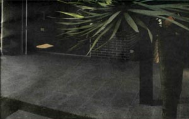
Sans frontiers ... (left) bi-fold doors allow a seamless transition to the outdoor spaces; (above) the living and dining areas are completely open to the garden.